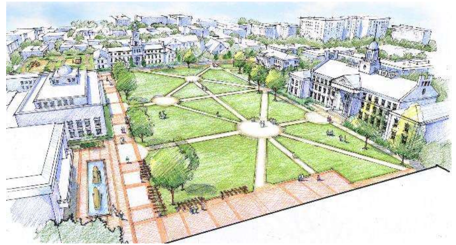
Masterplanning: Howard University Masterplan