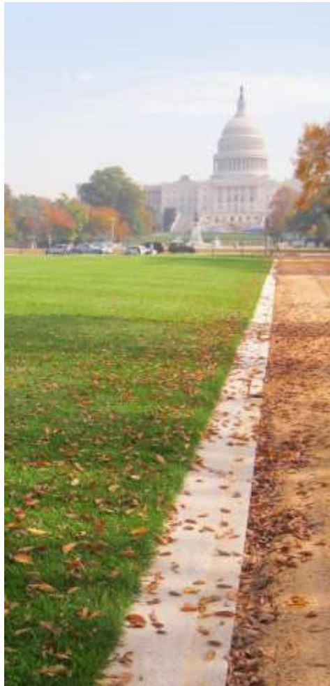
Landscape: National Mall reconstruction