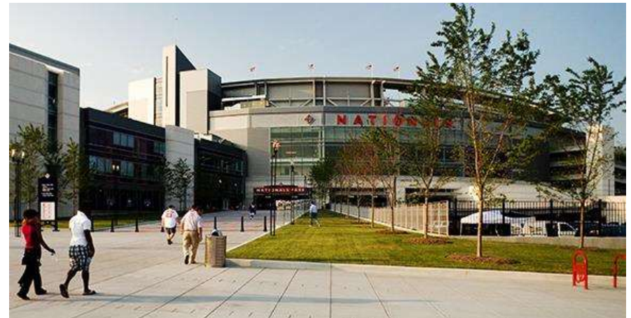
Architecture: Washington Nationals Ballpark