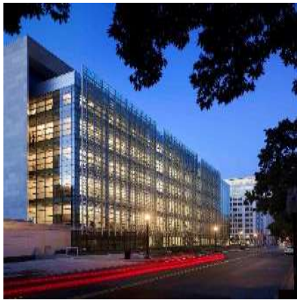
Architecture: DC Forensic Lab