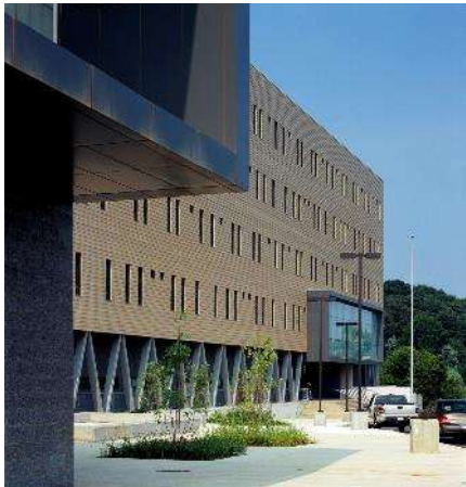
Architecture: Bladensburg High School